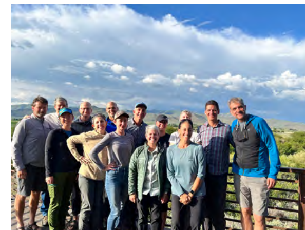
TNC Western U.S. and Canada state directors at their retreat in Idaho

We also share a birthday with Ash Meadows National Wildlife Refuge, because when TNC helped to protect this extraordinarily diverse place outside of Las Vegas 40 years ago, it became clear that Nevada needed its own chapter in our organization. We are excited to celebrate the refuge's anniversary, and our role in helping to protect it, on Earth Day 2024. More details to come, and we hope you will join us!