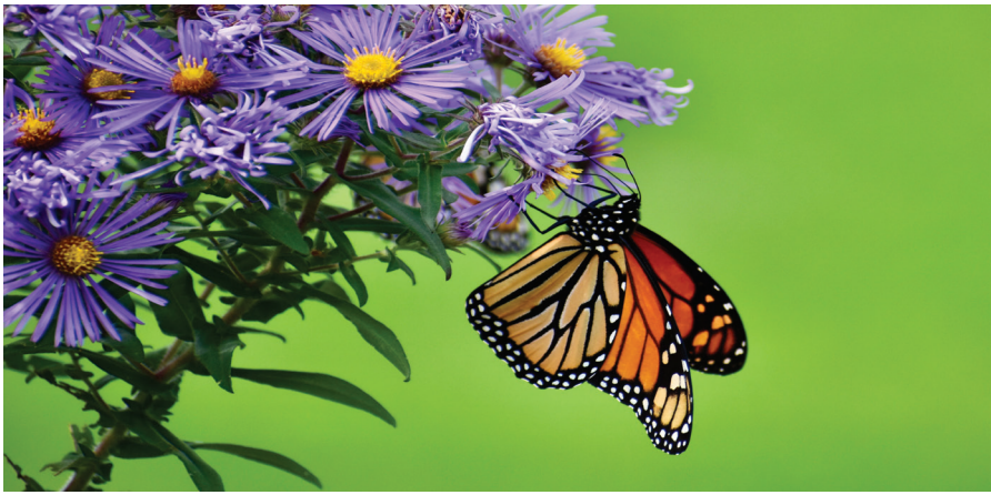
A Monarch butterfly at TNC's Hauser Nature Center

(continued from front) research took him to far-flung locales such as the Canadian Arctic and Antarctica. But closer to home, he and his family have always remained involved with TNC.