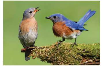
Eastern Bluebirds