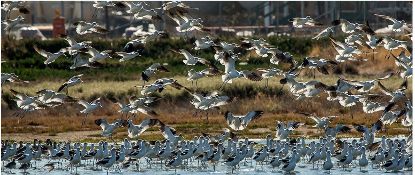
Richmond Water Enhancement Wetland