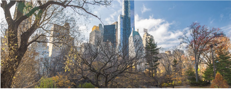
New York City Manhattan Central Park