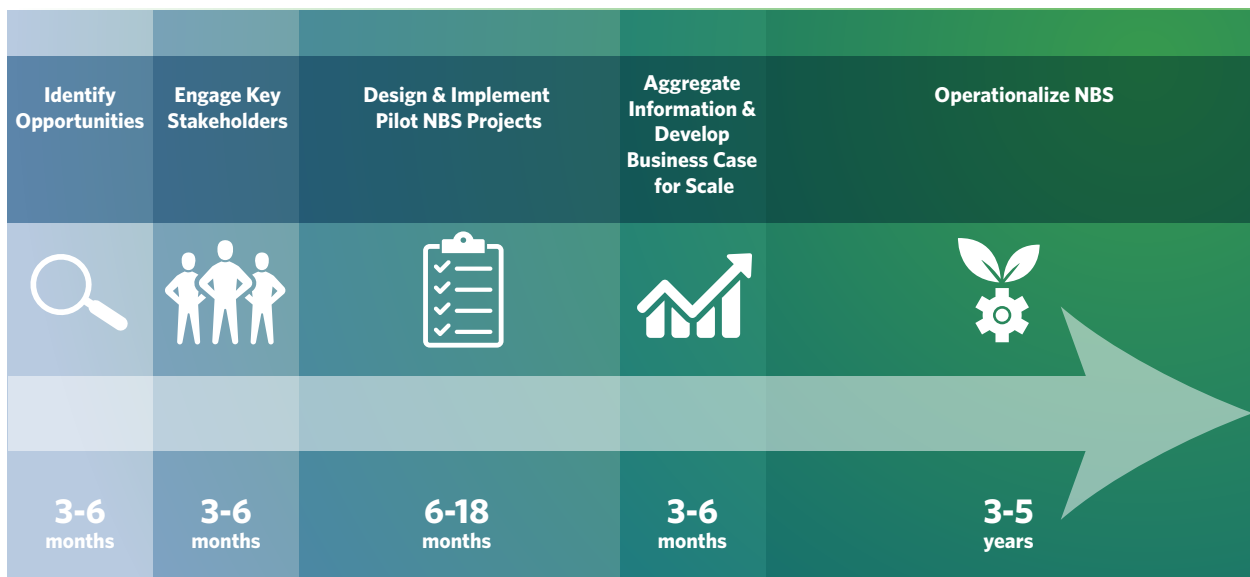
Figure 3 Estimated Timeline for NBS Operationalization. Recommended steps and timeframes for operationalizing NBS within a company.

In the final step, NBS is operationalized throughout the company . Ultimately, this step involves embedding NBS into all relevant business decisions and adopting a business decision-making process that considers the full suite of benefits of NBS, which typically have more ancillary benefits than business-as-usual grey alternatives. Operationalizing NBS takes time. Unlike the four preceding steps, this step may take years for a company to complete or may be a part of a decade-long company journey. Companies can create waves of success around operationalizing NBS by creating both short- and long-term goals that highlight more frequent achievements. It's important to recognize that fully operationalizing NBS may be beyond the scope of the company as it may require regulatory changes and/or scientific advances that will need to be made by external partners. Companies should focus on driving change within the areas where they can make tangible progress. Key stakeholders to engage with in this process include communications, who can convey a company's success internally and externally, and external partners, who can collaborate with the company to overcome broader barriers to NBS adoption.