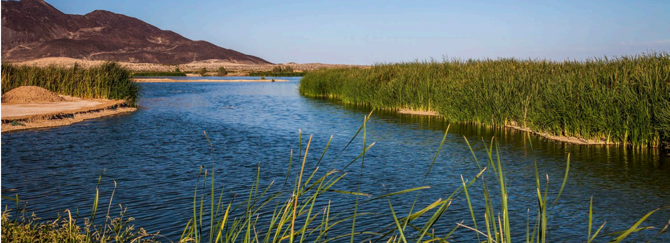
Constructed Wetland